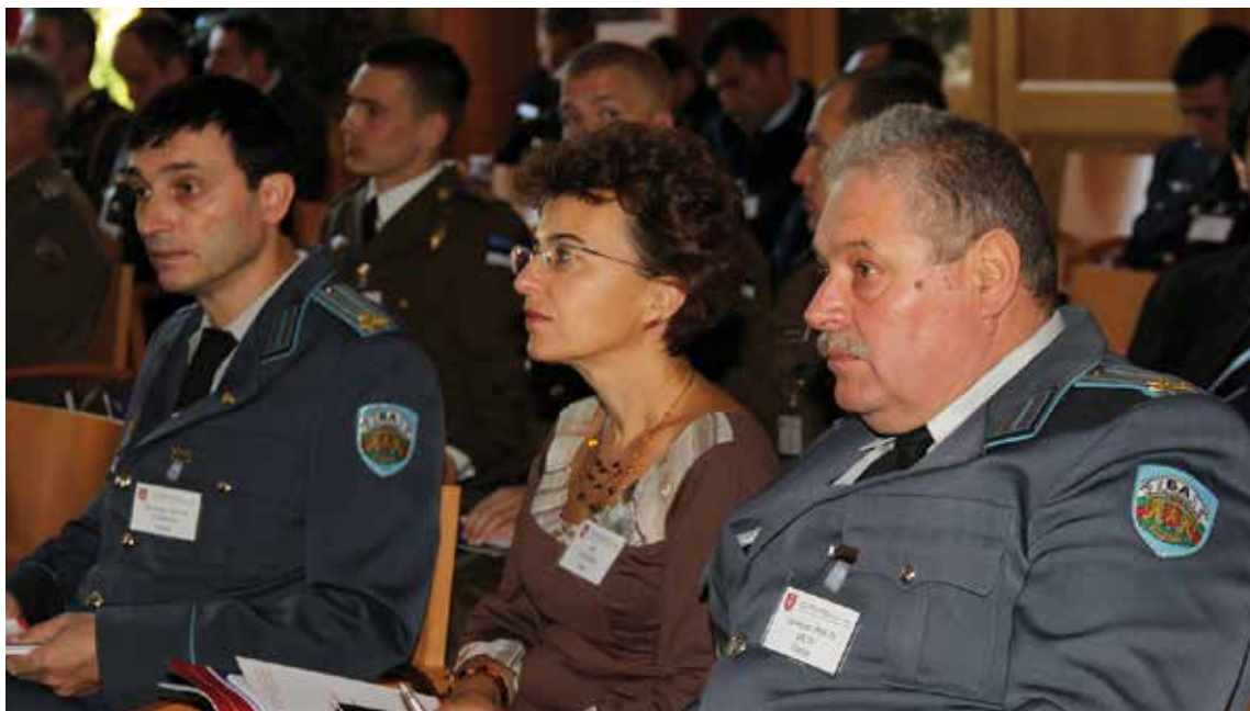
The Bulgarian Delegation from the Air Force Faculty.

In some cases before signing the bilateral agreement there are preliminary visits which aim to clarify and define more precisely the specialties, curricula and syllabus in order to recognize completely the period of the student exchange.