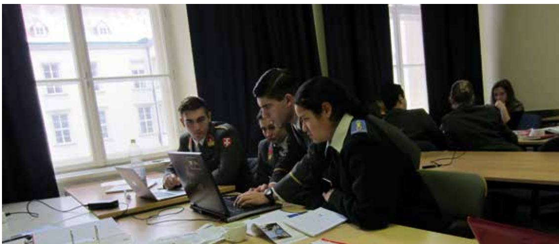
A group of participants discover and debate a case before the lecture, Austria 2012.