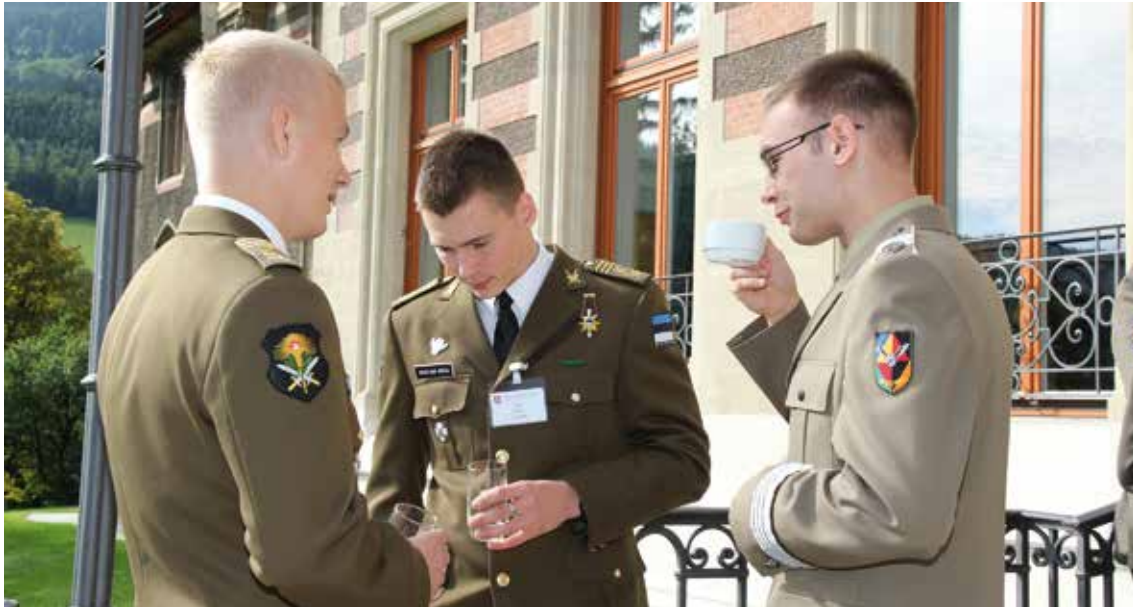
Cadets from Estonia and Poland during an iMAF-break.

As a main role or benefit of the EMILYO programme for the ENDC would be an increasing number military subjects and training exercises taught/organised jointly by different partner institutions with the focus on improving cadets' leadership skills and interoperability in tactical situations.