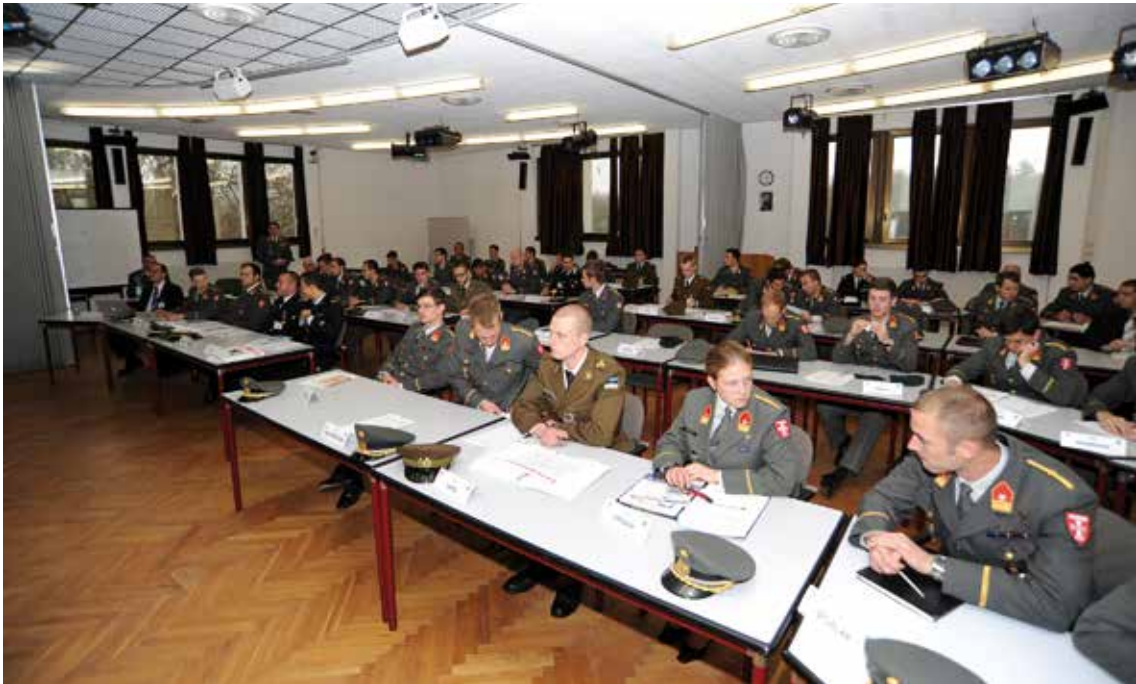
A lecture during a CSDP Module, Austria 2010.

Meanwhile, Portugal had proposed to organise the CSDP module as a seminar and to open it to European cadets. The three military academies of the Navy, the Army and the Air Force, with the support of the Secretariat of the ESDC, prepared this first event