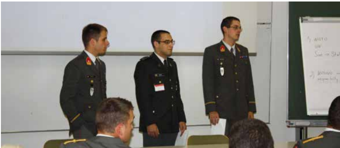
A presentation made by a group in front of the class during a CSDP-Module, Austria 2011.

In October 2011 the Austrian Military Academy organised again two consecutive modules in order to divide the audience and favour an interactive approach in learning. At this stage, the ownership of the students for their acquisition of knowledge and understanding of the CSDP was already an assimilated idea. That the environment contributes to the learning process was also widely acknowledged. Hence, the main innovation of the 2011 modules was to foster ownership for the students of the European environment, to which they give a major importance because this marked the transformation of the “living” from an outcome, i.e. the incidental result of the course of action, to an output of the module, i.e. the product of a purposely designed and managed process. The organising team, composed of the same managers as in 2010, 13 did so in asking the