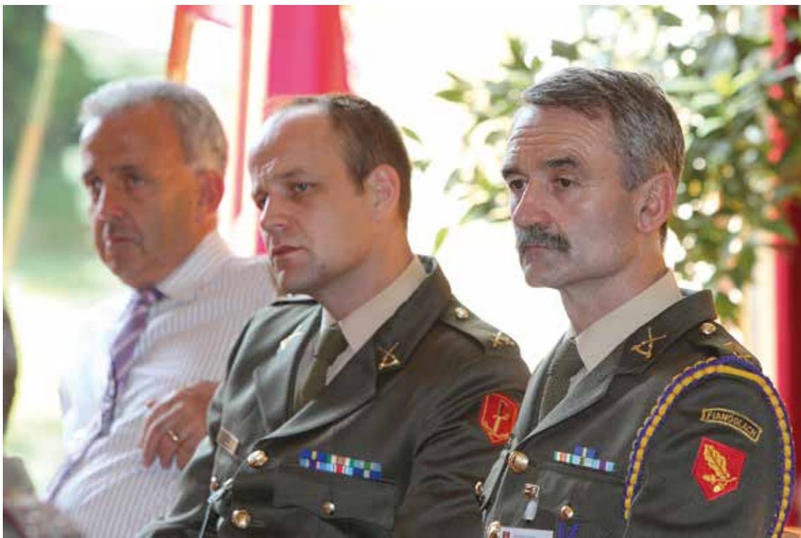
The Irish delegation during the iMAF 2013.