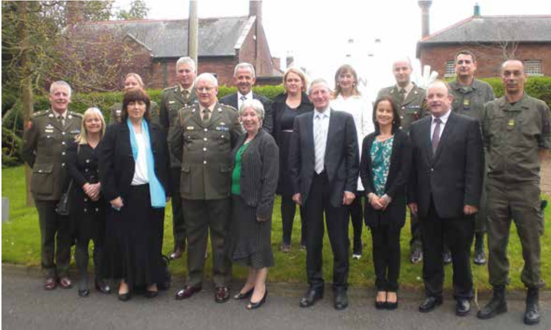
Expert Panel Visit May 2012.

establishment of the Academic Council, the appointment of the DF Registrar and the development of several policy documents dealing with quality assurance and programme management.