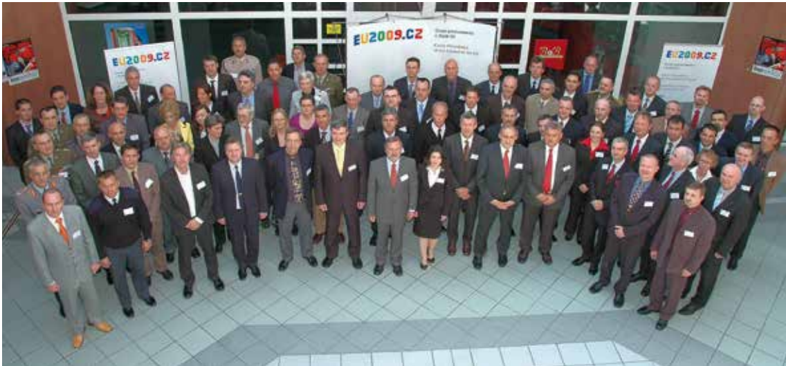
Meeting of the Implementation Group in Brno/Czech Republic in April 2009.

the Austrian Theresan Military Academy has – by history and culture of quality – a great experience of what is “maturation” and how an initiative such as the Initiative may bring its stone.