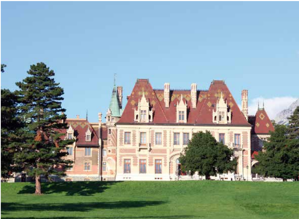
The Rothschild Castle in Reichenau/Austria.